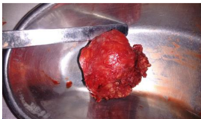
Pic-3: Specimen Picture of Parotid Pleomorphic Adenoma