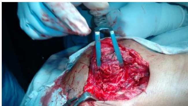
Pic-2: Intra-Operative Picture of Parotid Pleomorphic Adenoma