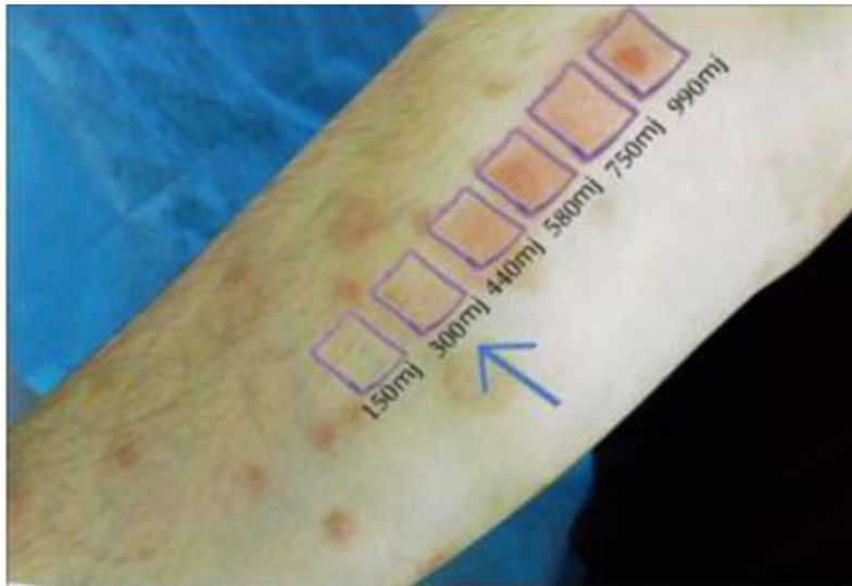
Figure-4: Psoriatic patient with MED to narrow band UVB at 300 mJ/cm 2