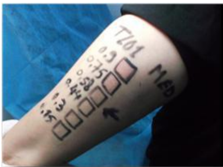
Figure-2: The examination location According to the accompanying table (Table 1), the patient's minimal erythema dose was determined to be 580mJ/cm 2 24 hours later