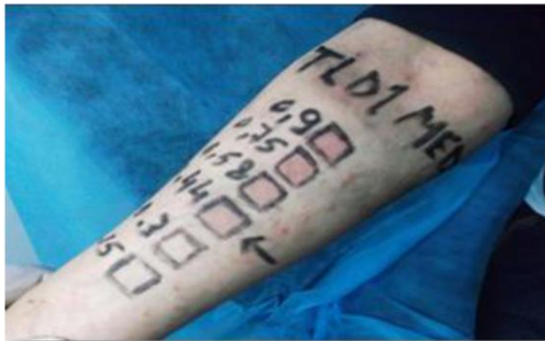
Figure-5: Eczema patient with MED of 440 mJ/cm 2