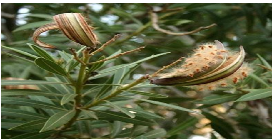
https://invasives.org.za/fact-sheet/oleander/ Figure 2: Nerium oleander (Apocynaceae)