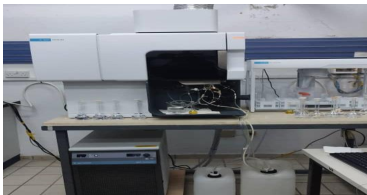
Figure 2.1. ICP-OES device

While the ash values ranged between 9.3 and 12.4 for the white color and 7.3 and 10.9 for the pink color.