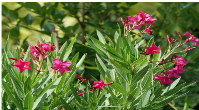
Figure 5: Oleander ( Nerium oleander )

https://problemsolvedpest.com/oleander-pretty-but-deadly/