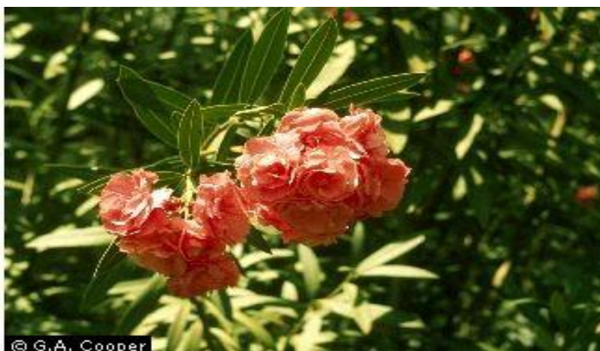
Figure 3: Oleander flowers white and pink

https://plants.usda.gov/home/plantProfile?symbol=NEOL