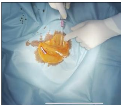
Figure 1 : placement of a central venous line

In our series we opted for the transcutaneous route by puncture of the subclavian vein or the internal jugular vein; the presence of venous blood reflux and good passage after injection were the criteria for the success of the implantation. The device is inserted into the subcutaneous space and attached to a muscular plane. The location of the box depends on the place of insertion of the catheter. Generally it is located under the clavicle and the catheter is introduced into a large vessel so that its distal end is located at the entrance to the right atrium, ideally in the superior vena cava (Figure 1,2,3,4).