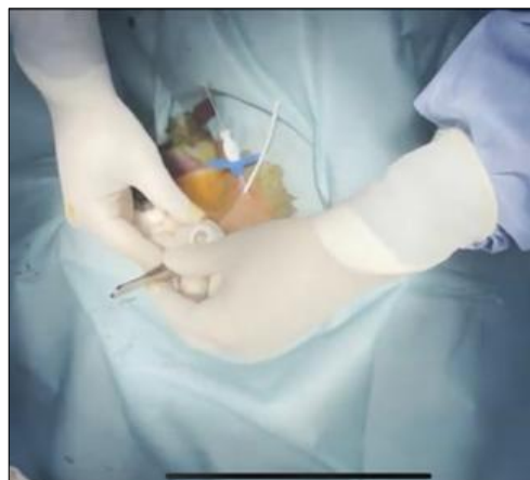
Figure 3: tunneling and setting up the chamber