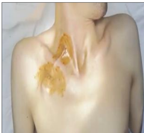
Figure 4: post-operative appearance

An X-ray check in the operating room showing the location of the catheter and the chamber (Figure 5).