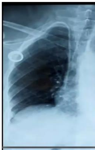
Figure 5: control x-ray

An X-ray check in the operating room showing the location of the catheter and the chamber (Figure 5).