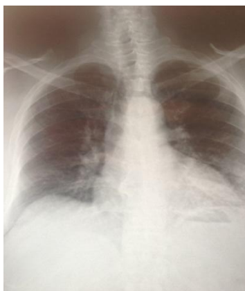
Figure 1: Chest x-ray showing left basal pulmonary rail image

The chest x-ray showed a left basal pulmonary rail image, without highlighting the foreign body (Figure 1).