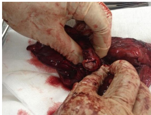
Figure 3: lower left lobectomy

thoracotomy passing through the 5th intercostal space. A bronchotomy was carried out allowing the extraction of the foreign body with left lower pulmonary lobectomy (Figure3, 4).