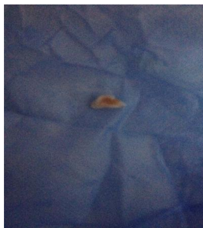
Figure 4: foreign body (bone fragment)

The surgical procedure was completed by the placement of two chest tubes which were removed on day 2 and day 4 (Figure 5).